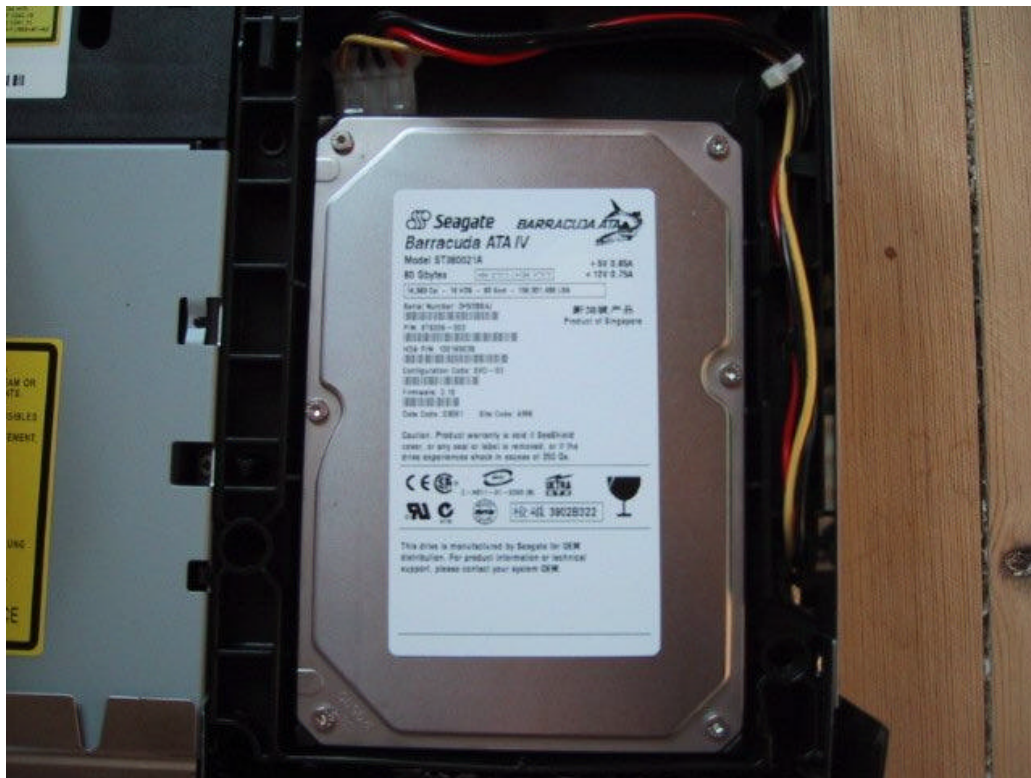
The Seagate drive is very silent, but it also gets really warm...

According to my investigations Seagate drives are the most silent ones. I decided to go with Seagate 80GB. It generates 25db. (The 40GB version only generates 21db!).